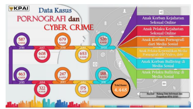
Figure 2. The case of pornography and cyber crime KPAI 2020

media using cellphone technology, many do things that are not right. As data from KPAI regarding cyber crime are as follows: