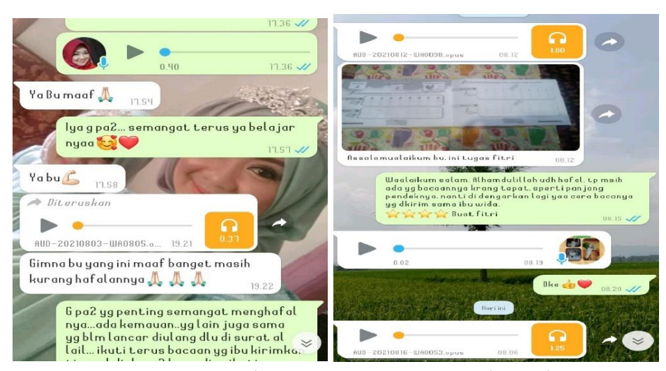
Figure 2. Student communication with teacher

repeatedly to make students memorize and understand the material presented. According to Pangastuti, this classical learning model is a learning pattern carried out by the teacher with a group of students in one class simultaneously (Pangastuti, 2014). This type of learning method includes the traditional method and the oldest commonly applied (Mulyasa, 2012). However, in learning at Junior High School Plus Babussalam Bandung, this method combines with individual methods due to online learning and the lack of facilities.