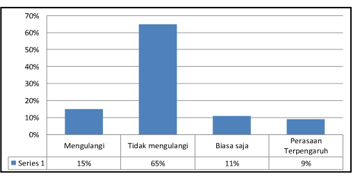
Figure 1.3 Students' Attitude After Access the Negative during the Virtual Learning Content in the Covid-19 Pandemic

Based on the data, although virtual learning is the safest alternative to avoid physical contact, it is prone to negative impacts. First, if varied learning methods do not support it, it will lead to boredom. It is found that 28% student is unhappy, and 28% student feels bored. It is quite a great number. It needs to be the entry point for the betterment of the learning service. This portrait is similar to the survey on distance learning conducted by the Indonesian Child Protection Commission in 2020. It took 20 provinces, 54 districts/cities. It found that 76.7% of students were not happy/bored of participating in online